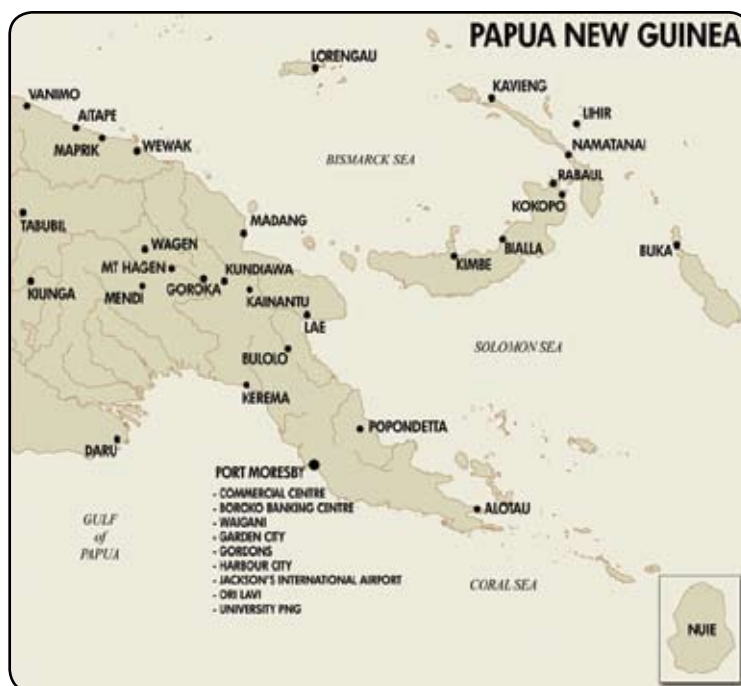
Figure 2: BSP Branch Network 25